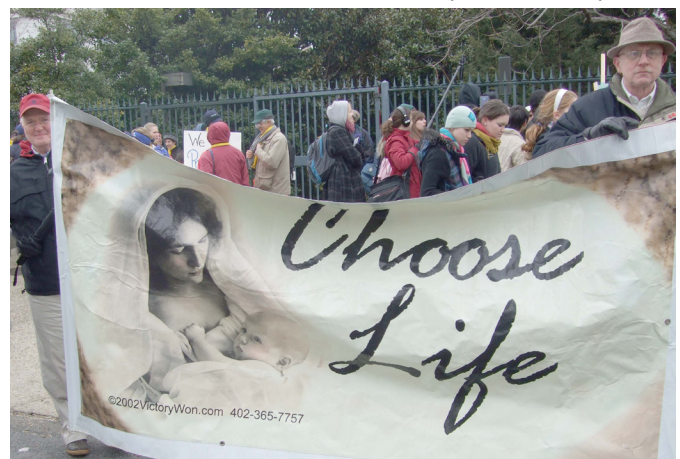
CCHL, Blair County Chapter, at March for Life, January 22, 2010

If you, or someone you know, is experiencing a crisis pregnancy, help is available. Call Birthright , 2706 7th Ave., Altoona, 814-943-8185; or Precious Life, Inc. , 1716 12th Ave., Altoona, 814-944-2669. For information on Natural Family Planning, go to: www.ForYourMarriage.org or www.familyplanning.net . For post-abortion counseling, contact Project Rachel , 814-884-8000; www.ProjectRachel@dioceseaj.org ; or Rachel's Vineyard , 877HOPE4ME (877-467-3463); www.rachelsvineyard.org/ . For those with life-limiting illnesses, contact Home Nursing Agency , 201 Chestnut Avenue, Altoona 16603, 814-946-5411, 1-800-445-6262 or email: help@homenursingagency.com . Family Life, Diocese of Altoona/Johnstown, offers pastoral guidance, call 814-886-5551; email: familylife@dioceseaj.org .