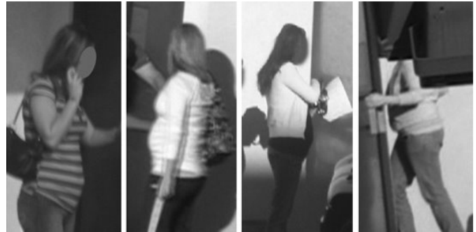
Mothers and children entering killing facility, Wichita, Kansas

not human. We resolve that could never happen again. But it is. And it's happening to people here in America, in our own neighborhoods. Abortion is a silent modern-day holocaust of precious babies being killed because people are spreading the lie that they are not human.