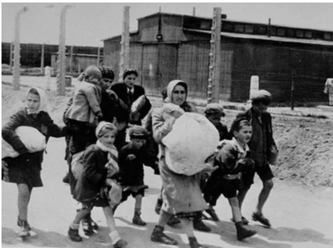
Mothers and children entering killing facility, Auschwitz

charred rubble of these former places of death, while in a vast expanse where rows of wooden barracks once stood, chimney stacks remain in eerie silence like skeletons, testifying to the mass murder of Hitler and his Nazi army. Time will never fully heal the pain and anguish caused by such horrific deeds—these places forever poisoned by lasting memories. My heart ached as I heard story after story of man's inhumanity to man.