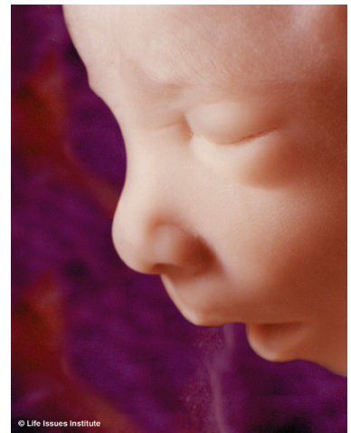
Sixteen weeks from conception