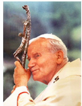
Pope Saint John Paul II

How did our culture become so indifferent to the sanctity and equality of human life? Roe v. Wade had a lot to do with it, of course. But subsequent to that, three major cultural tipping points fueled popular acceptance of death-culture paradigms.