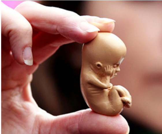
A pro-life campaigner holds a model of a 12-week-old embryo