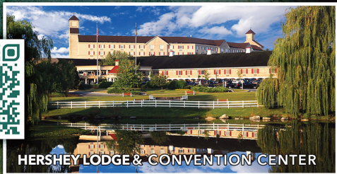
HERSHEY LODGE & CONVENTION CENTER