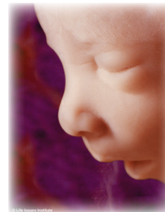
Sixteen weeks from conception

Yes! I believe that human life is precious and I want to help the Blair County Chapter of Citizens Concerned for Human Life (CCHL) in its life-saving work!