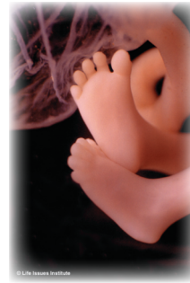
Eleven weeks from conception