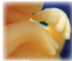
Seven weeks from conception